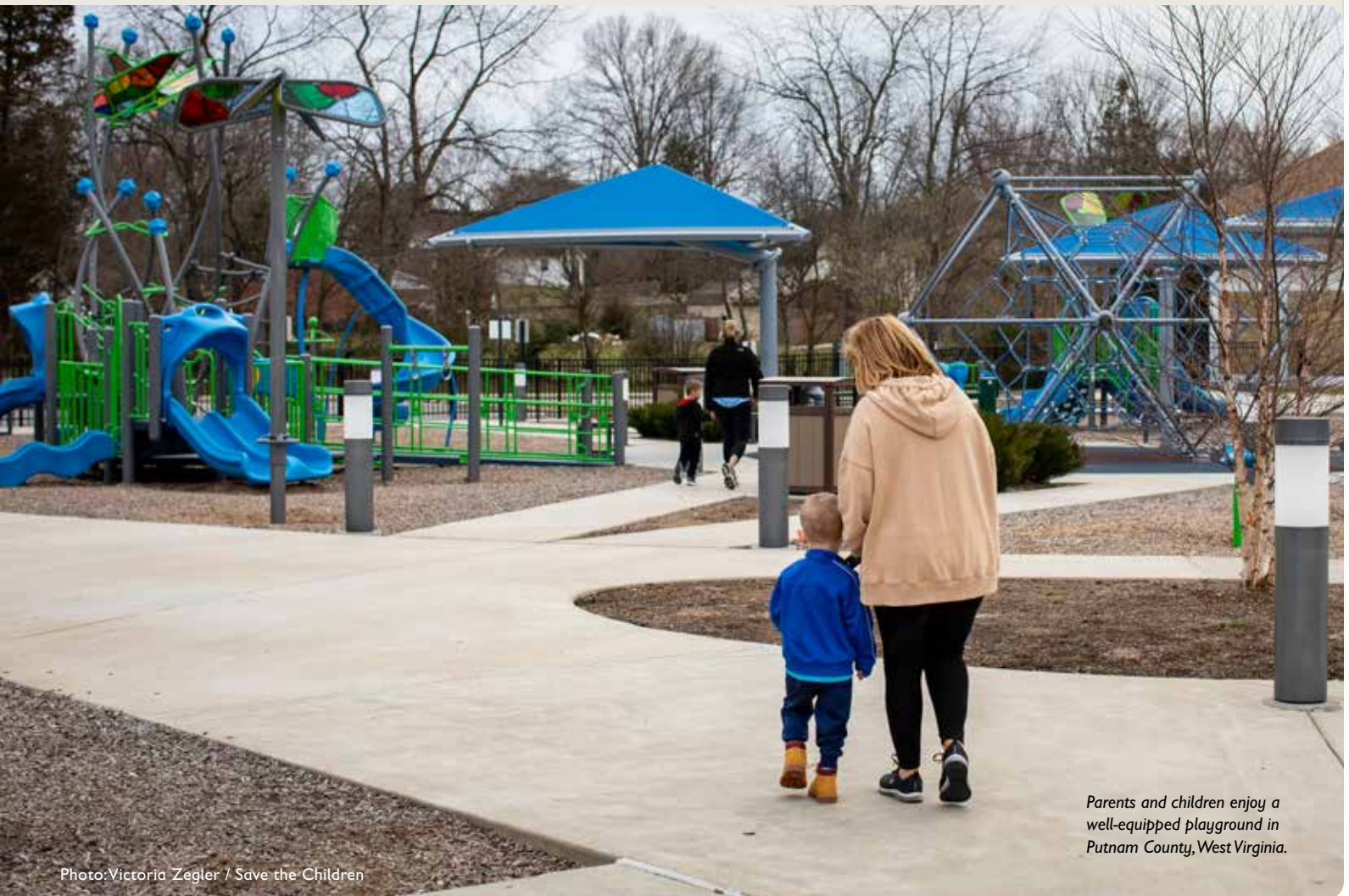
Parents and children enjoy a well-equipped playground in Putnam County, West Virginia.