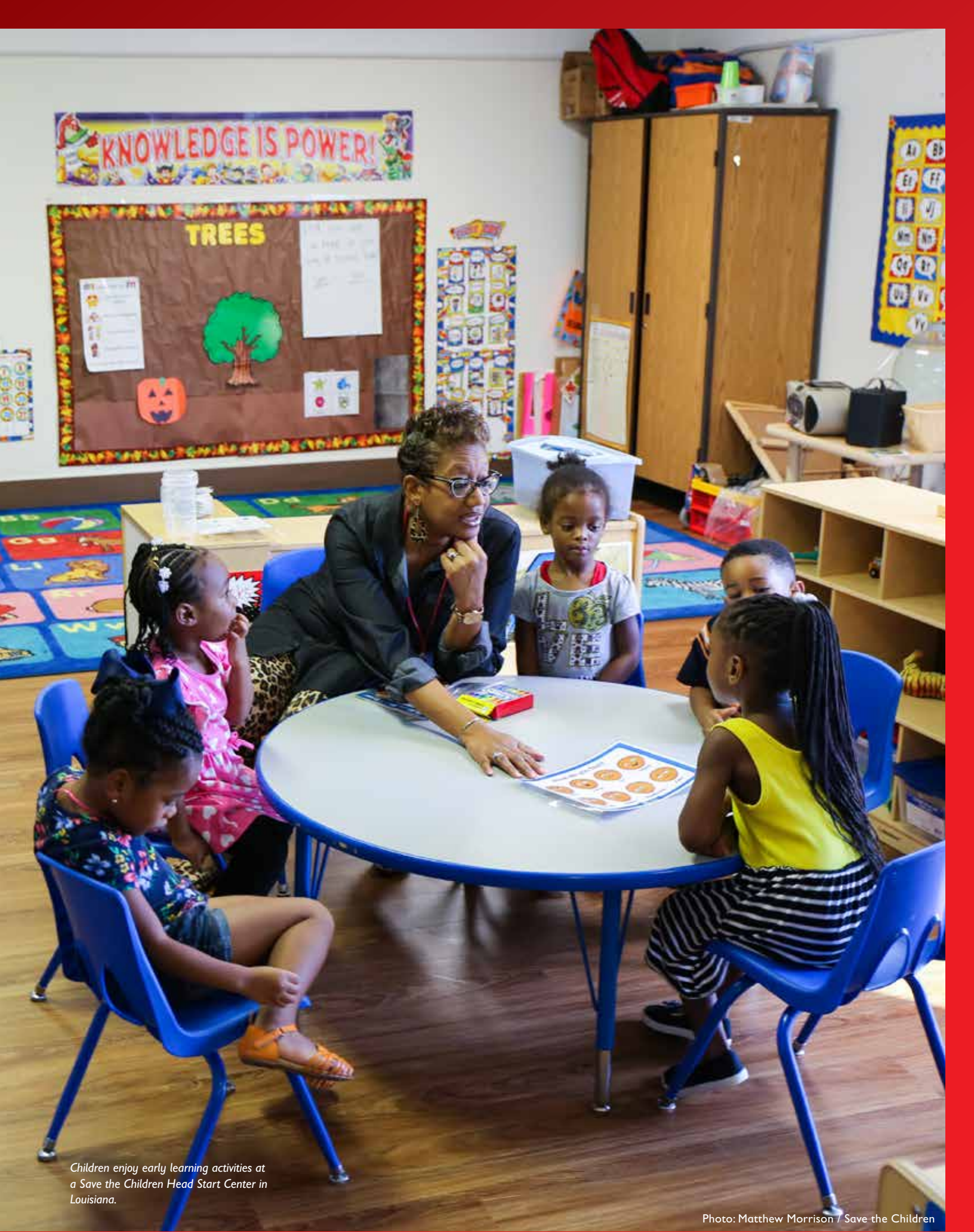
Children enjoy early learning activities at a Save the Children Head Start Center in Louisiana.