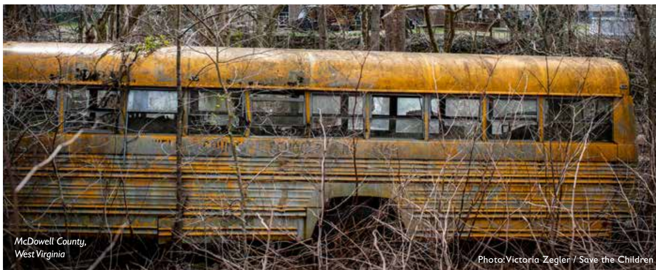
McDowell County, West Virginia