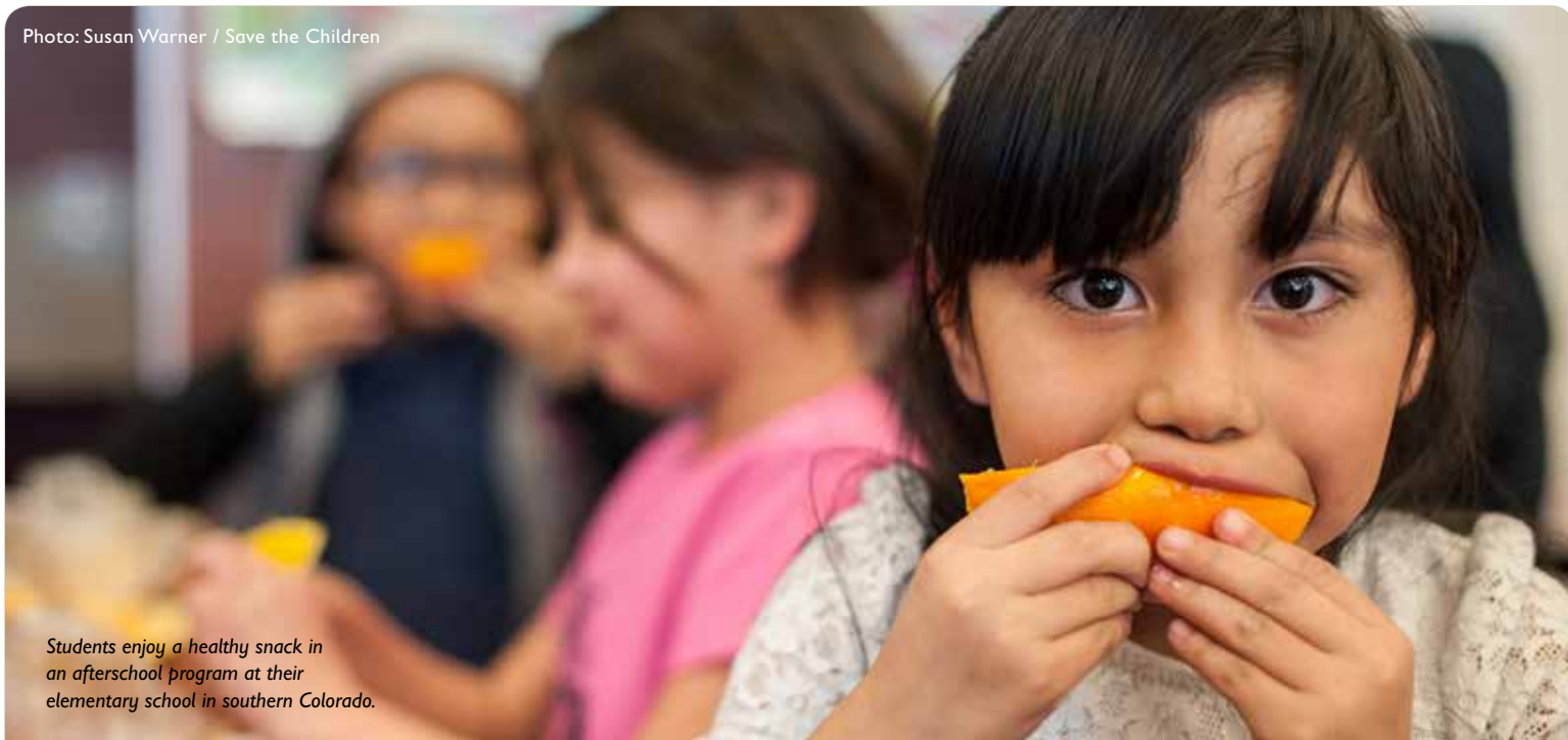
Students enjoy a healthy snack in an afterschool program at their elementary school in southern Colorado.