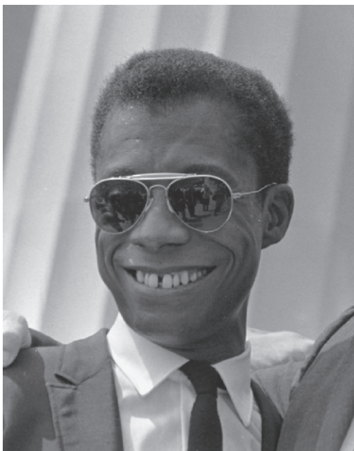
James Baldwin at the Civil Rights March on Washington.

tolerance.org/classroom-resources/lessons