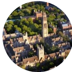
Education – Title IX