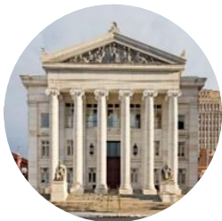
Pre and Post Arrest Advocacy