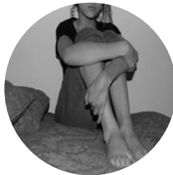
Family & Civil Protective Orders