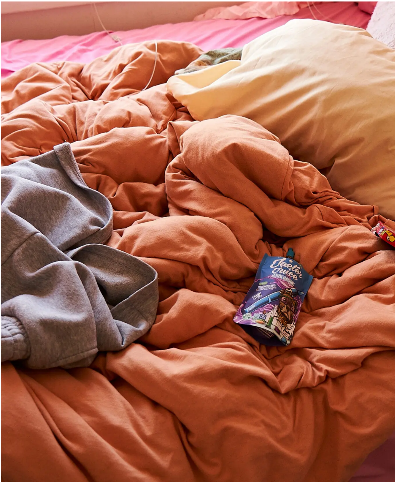
A liquid live resin in a girl's bedroom. Some concentrated cannabis products are designed to look like juice boxes to highlight their fruity flavors.

Meanwhile, the average level of CBD — the nonintoxicating compound from the cannabis plant tied to relief from seizures, pain, anxiety and inflammation — has been on the decline in cannabis plants. Studies suggest that lower levels of CBD can potentially make cannabis more addictive.