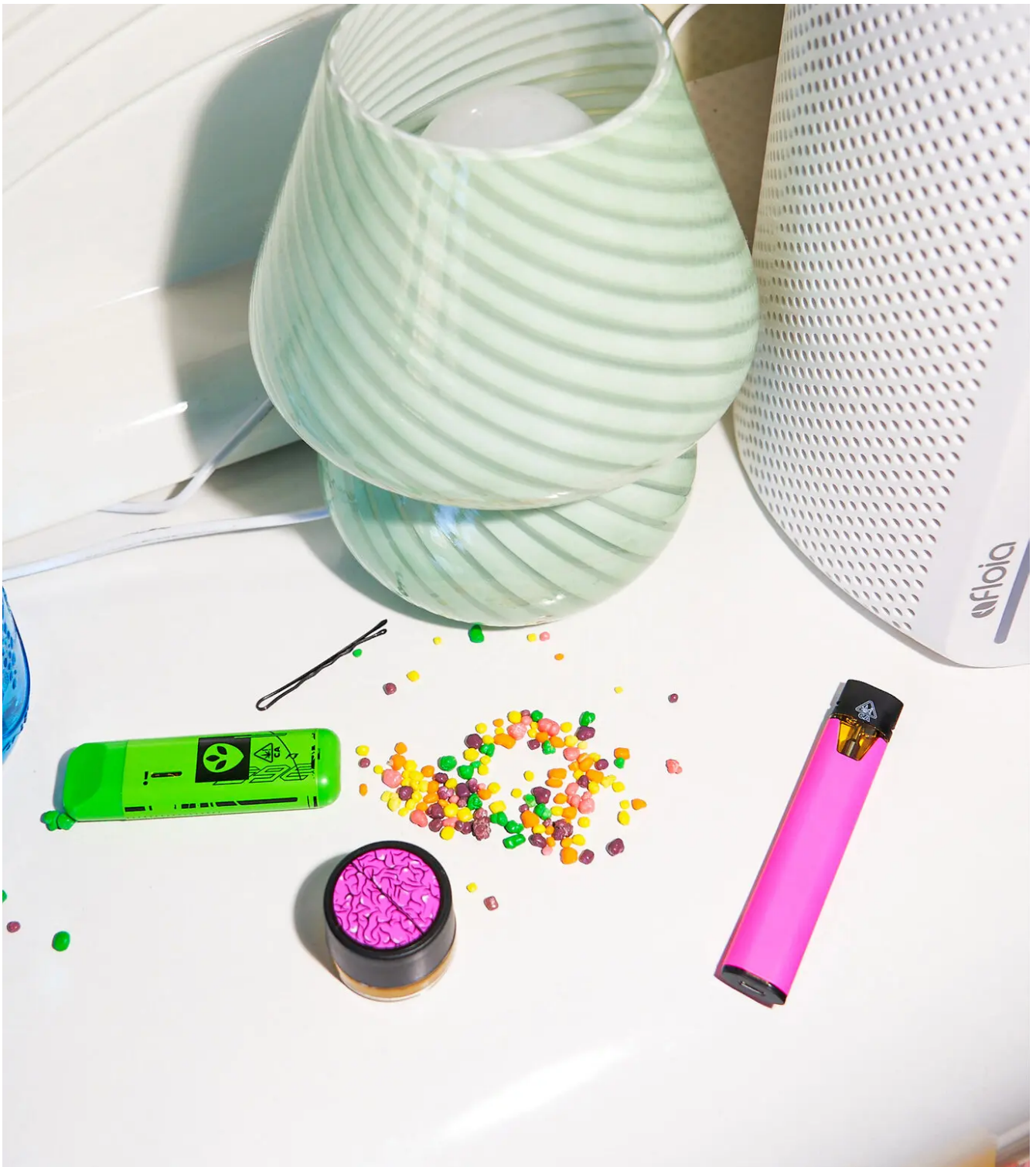
Brightly colored vapes alongside a container of cannabis resin wax. In recent years, products like waxes — many containing more than 90 percent THC — have become increasingly popular.