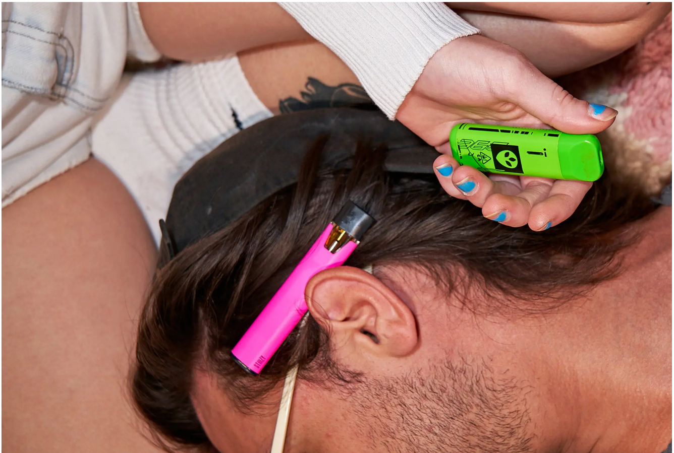
A couple with cannabis vape pens. In 2020, 35 percent of high school seniors, and as many as 44 percent of college students, reported using marijuana in the past year.

One rigorous study found that the risk of having a psychotic disorder was five times higher among daily high potency cannabis users in Europe and Brazil than those who had never used it.